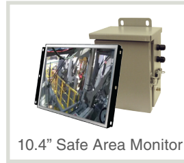
10.4" Safe Area Monitor