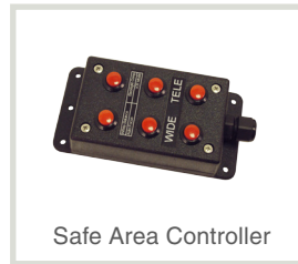
Safe Area Controller