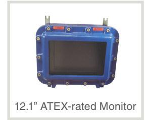
12.1" ATEX-rated Monitor